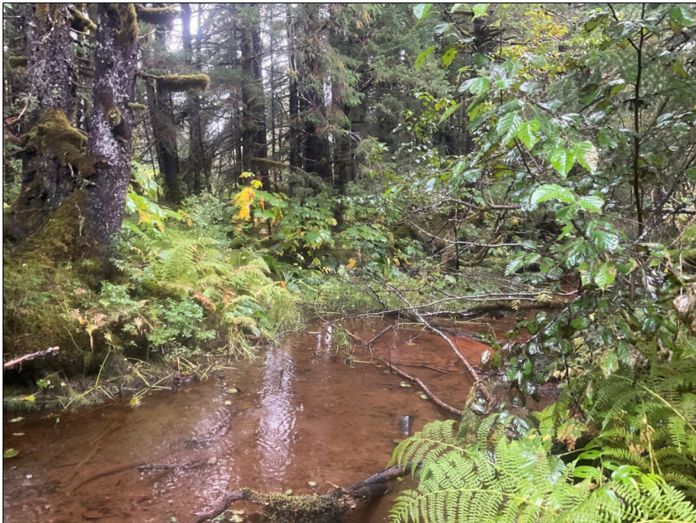
Figure 3.—Ponded area at upper extent where minnow trap was set.