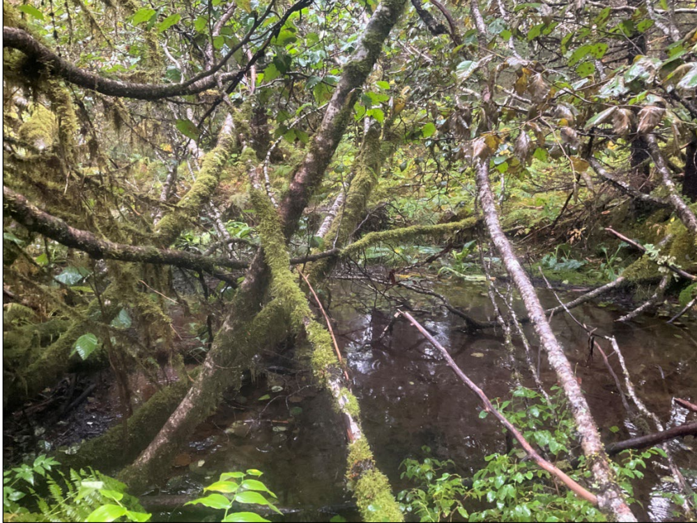
Figure 2.—Ponded area at upper extent of the stream.