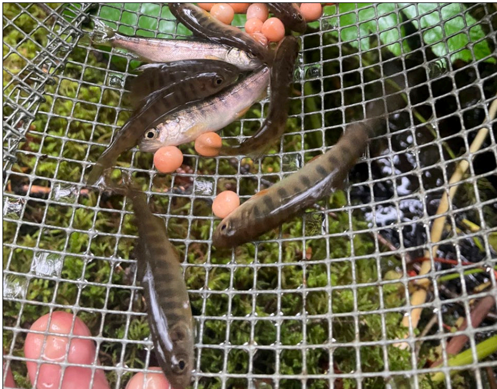
Figure 1.–Juvenile coho salmon captured at waypoint 1344.